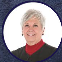
Hon. Kimberly S. Dowling Judge Delaware County Circuit Court 2